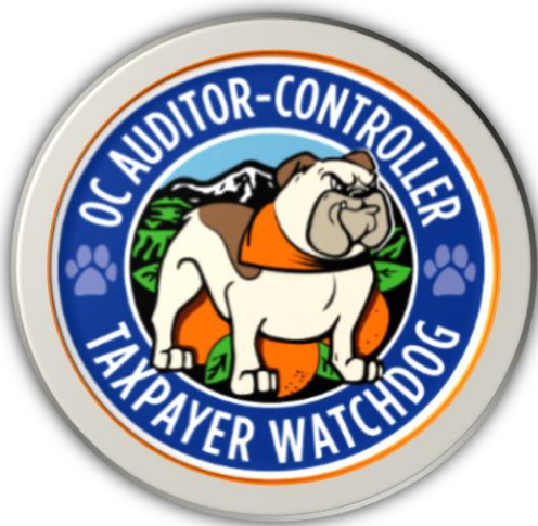
OC Auditor Controller Watchdog Logo