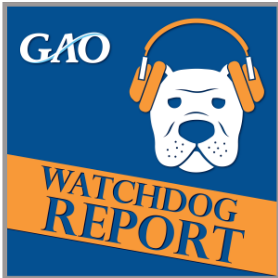
United States GAO Watchdog