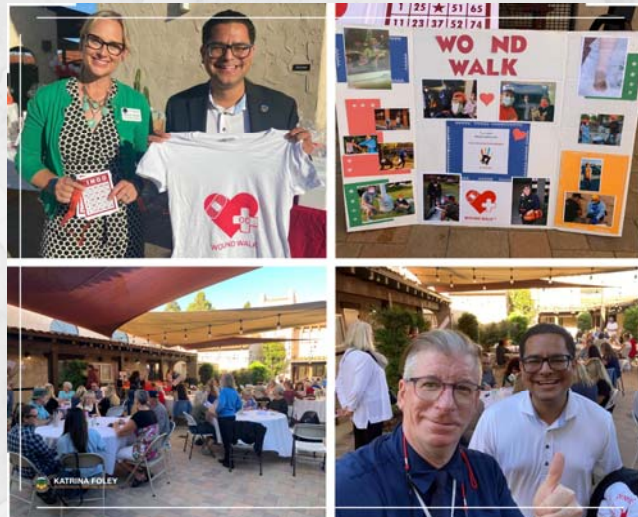
Wound Walk OC