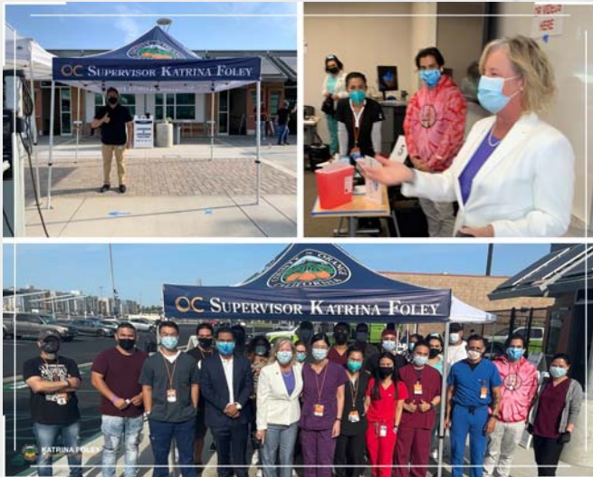
Orange Coast College (Mini Pod Clinic)