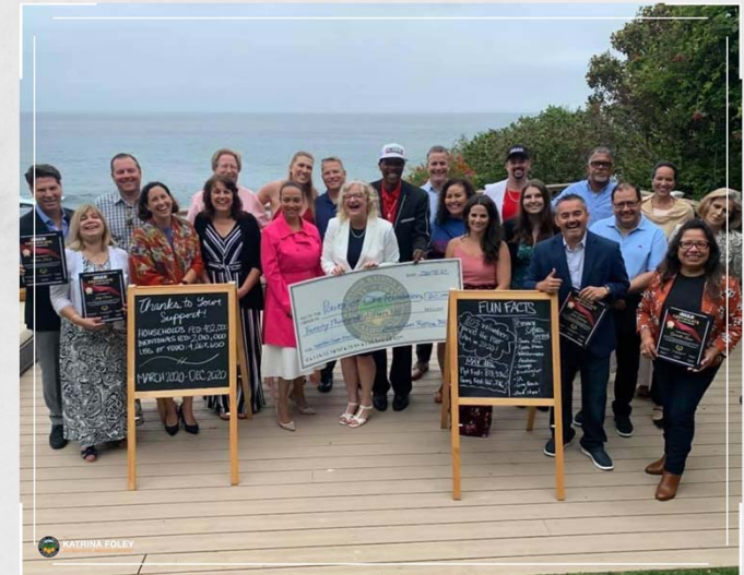
Power of One (Stakeholder Soiree)