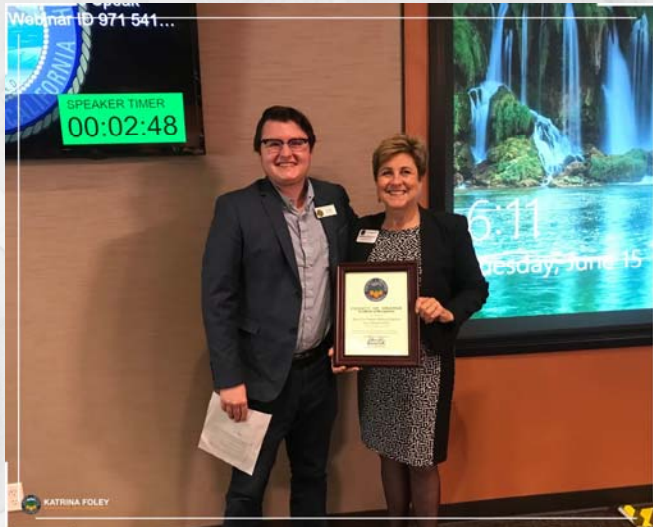
Recognizing New Huntington Beach Mayor Pro Tem Barbara Delgleize