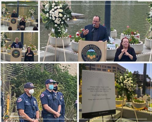
COVID Memorial on the Avenue of the Arts