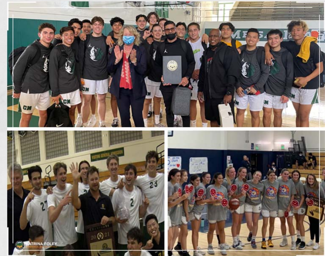
Recognizing our CIF Champions!