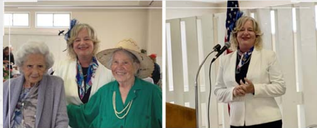
Costa Mesa Women's Club Meeting