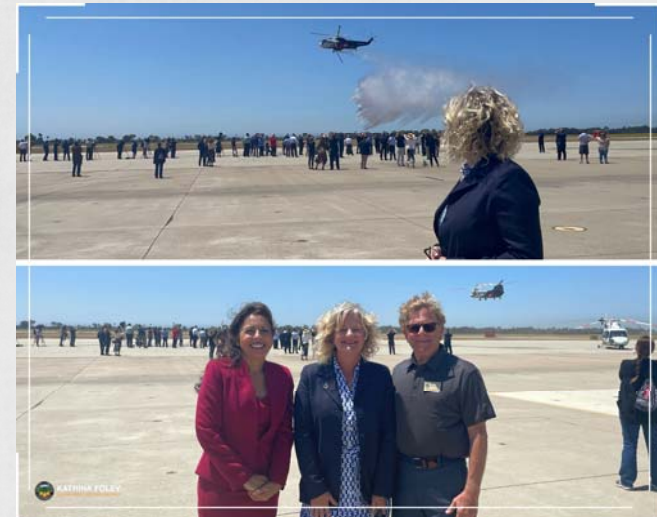
Los Alamitos Fire Response Demonstration