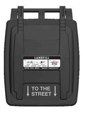
2021 Exclusive Franchise Agreement