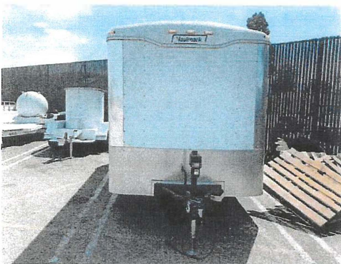
Description: Trailer 2