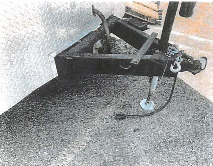
Description: Trailer 4