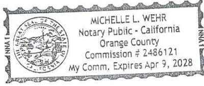
Place Notary Seal Above

Signature [Handwritten Signature] Signature of Notary Public