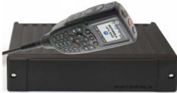
Figure 5-4:APX 8500 Mobile Shown with O3 Control Head