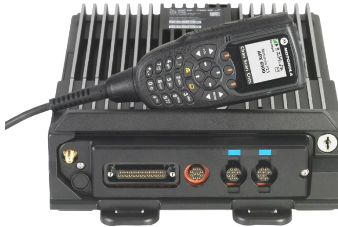
Figure 5-2:APX 6500 Mobile Shown O3 Control Head