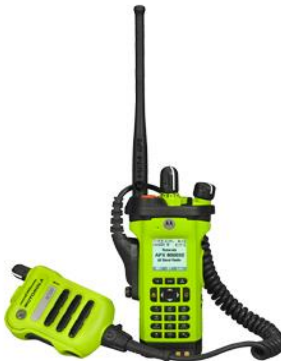
Figure 6-4: APX 8000XE with Green Housing