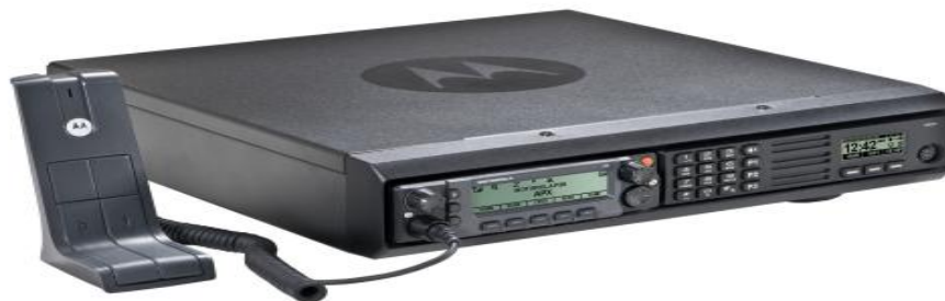
Figure 7-1: APX 8500 Consolette with Full Front Panel