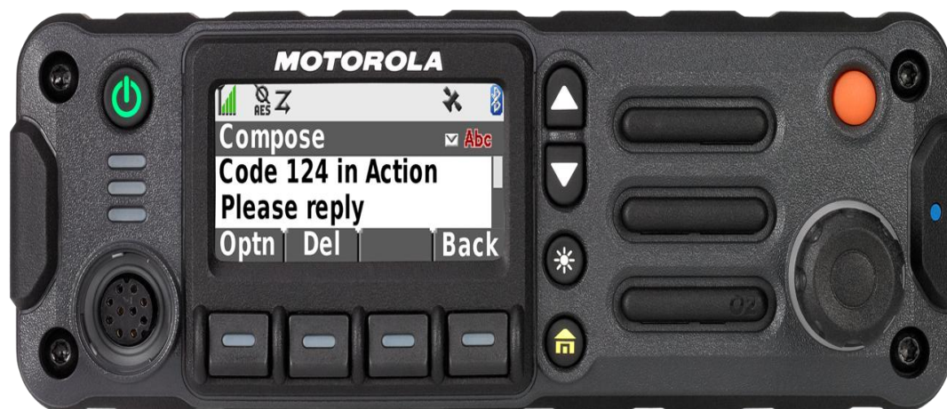
Figure 5-5: APX 4500 Mobile Radio with O2 Control Head

APX 4500 P25 mobile radio delivers all the benefits of TDMA technology in a compact P25 capable mobile. The APX 4500 seamlessly unifies public works, utility, rural public safety and transportation users to first responders. The APX 4500 is conveniently small and easy to install. A simplified dash mount design makes installation quick and easy, fitting into the existing XTL™ footprint so you can reuse mounting holes and cables. The APX 4500 with Enhancement Level 1 come with 1000 programmable channels, intelligent lighting, day/night mode, built in 7.5 watt speaker and emergency button. The APX 4500 has evolved to support newer technologies like Wi-Fi. Direct cloning with Legacy models will not be available.