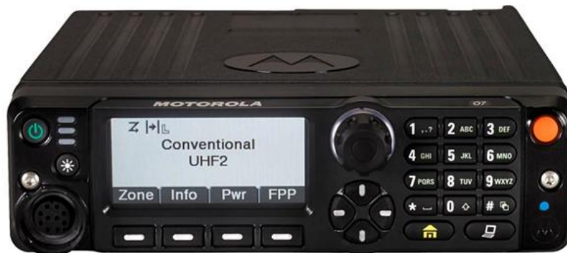
Figure 5-3: APX8500 Mobile Radio Shown with O7 Control Head

The APX 8500 mobile radio meets P25 public safety specifications for multi-agency collaboration by offering the option to operate in three separate band configurations. APX 8500 mobiles can work across multiple digital and analog networks from conventional, to SMARTNET® and SmartZone® to ASTRO® 25 providing true P25 functionality. When multiband operation is needed, the APX8500 is capable of being programmed with any three frequency bands. Improve response time by instantly operating on digital or analog networks, in 7/800, VHF, UHF Range 1 and 2 bands at any given time.