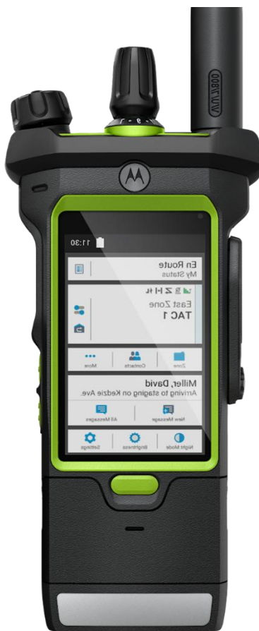
Figure 6-9: APX NEXT XN