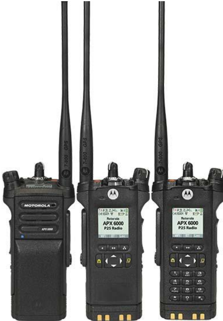
APX 6000 (Back)

RADIO PACKAGES NOT LISTED ARE 27.5% OFF LIST AND ACCESSORIES ARE 20% OFF LIST PER SECTION 10 "ADDITIONAL DISCOUNTS" SECTION OF THIS PRICE BOOK. ALL OTHER DISCOUNTS FOR PRODUCTS AND SERVICES ALSO LISTED IN SECTION 10.