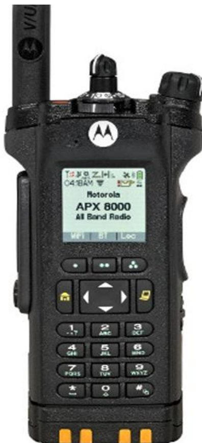
Figure 6-3: APX 8000