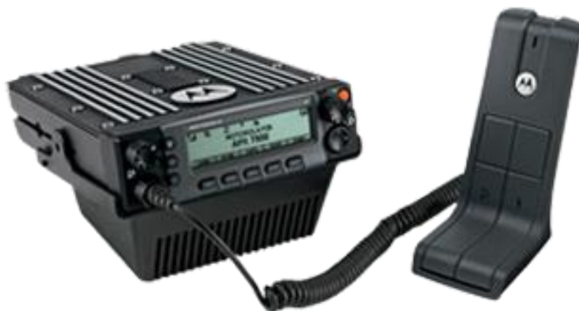
APX 6500 Control Station

RADIO PACKAGES NOT LISTED ARE 27.5% OFF LIST AND ACCESSORIES ARE 20% OFF LIST PER SECTION 10 "ADDITIONAL DISCOUNTS" SECTION OF THIS PRICE BOOK. ALL OTHER DISCOUNTS FOR PRODUCTS AND SERVICES ALSO LISTED IN SECTION 10. FOR SPEAKER MICS AND ADDITIONAL ACCESSORIES PLEASE REFER ACCESSORIES CATALOG, AVAILABLE AT https://shop.motorolasolutions.com/?_ga=2.209673489.265811969.1588006669-1558378512.1587576280