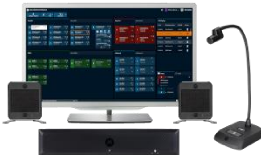
Figure 9-1: Dispatch Center Equipment

Please contact your Motorola Account Manager prior to purchasing this equipment. Engineering and technical considerations are required. Discount listed in section 10.