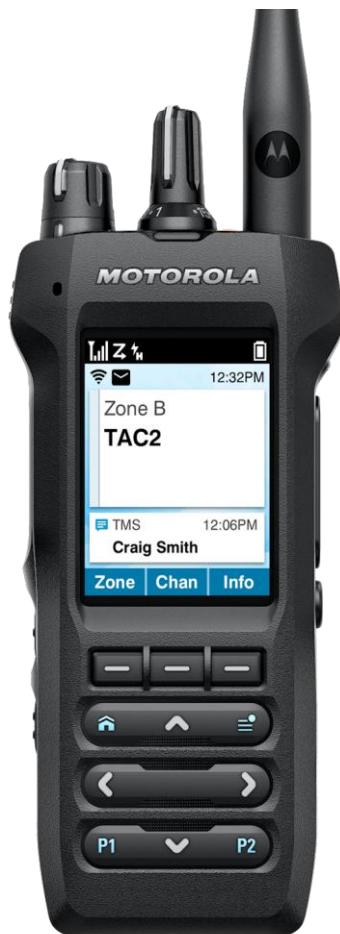
Figure 6-5: N50