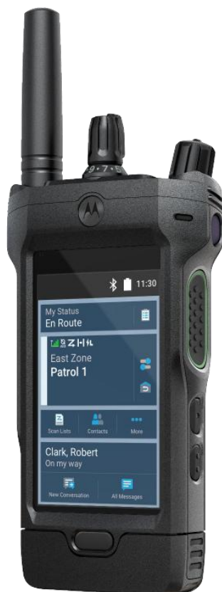
Figure 6-7: APX NEXT