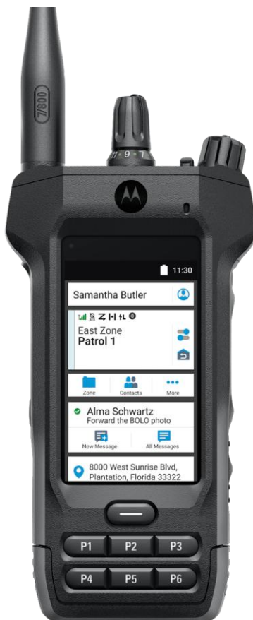
Figure 6-6: N70