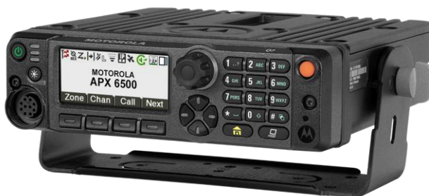
Figure 5-1: APX 6500 Enhanced Mobile Shown with O7 Control Head

From street patrols to multi-agency response APX 6500 Enhanced mobiles provide the highest level of interoperability. APX mobiles can work across multiple digital and analog networks from conventional, to SMARTNET® and SmartZone® to ASTRO® 25 providing true P25 interoperability. The APX 6500 has evolved to support newer technologies like Wi-Fi, and SmartConnect. Direct cloning with Legacy models will not be available.