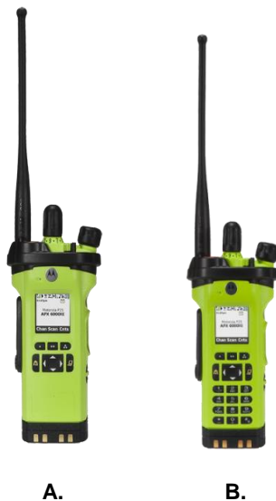
Figure 6-2 (A) APX 6000XE Model 2.5 (Yellow) and (B) Model 3.5 (Impact Green) (Lower capacity battery pictured)

APX 6000XE meets P25 public safety standards and will seamlessly interop with all vendor P25 radios for multi-agency collaboration. Extreme rugged and ergonomic design with innovative features developed specifically to enhance personnel safety in extreme environments. Portables can work across multiple digital and analog networks from conventional, to SMARTNET® and SmartZone® to ASTRO® 25 providing true P25 functionality.