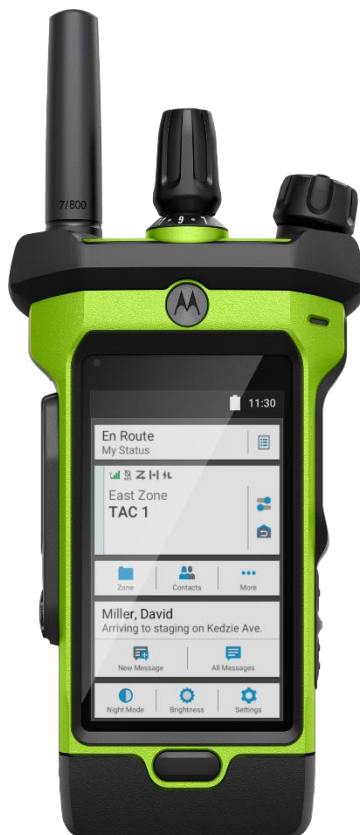
Figure 6-8: APX NEXT XE